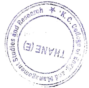
Shreekant Pol Head-Academics