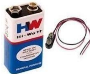
Figure 5. Power Supply

The nine-volt battery, or 9-volt battery, is an electric battery that supplies a nominal voltage of 9 Volts, actually 7.2 to 9.6 volts, depending on technology. Batteries of various sizes and capacities are manufactured; a very common size is known as PP3, introduced for early transistor radios.