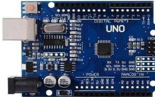
Figure 8. Arduino UNO

The Arduino UNO is categorized as a microcontroller that uses the ATmega328 as a controller in it. The Arduino UNO board is used for an electronics project and is mostly preferred by beginners. The Arduino UNO board I type of Arduino board only. As the board can be easily connected to the other computer system via USB port the board is capable of getting the power supply from a DC adaptor having a voltage of 12 V. The board can be charged from this external power supply.