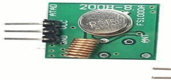
Figure 2. 315 MHz RF Transmitter Module

It operates at a range of 3-12V which is also the power operating volts of most of the microcontrollers and boards. The module uses the ASK (Amplitude Shift Key) modulation method to transmits the data. It is one of the very low-cost power effective modules for both commercial, hobbyist, and developers. 433MHz Transmitter is one of the cheapest RF transmitters and it has a lot of applications and can be used interface with almost every microcontroller.