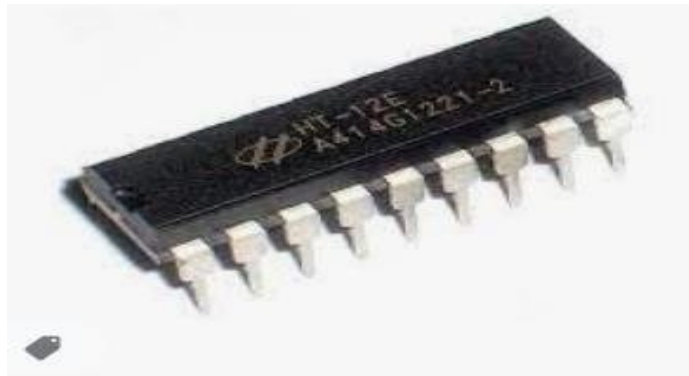
Figure 3. HT-12E Encoder IC

HT12E is an encoder integrated circuit of 2^{12} series of encoders. They are paired with 2^{12} series of decoders for use in remote control system applications. It is mainly used in interfacing RF and infrared circuits. The chosen pair of encoder/decoder should have same number of addresses and data format.