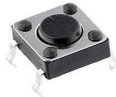
Figure 4. Push Button

A push-button or simply button is a simple mechanism to control some aspect of a machine or a process. Buttons are typically made out of hard material, usually plastic or metal. The surface is usually flat or shaped to accommodate the human finger or hand, so as to be easily depressed or pushed. Buttons are most often biased switches, although many un-biased buttons still require a spring to return to their un-pushed state.