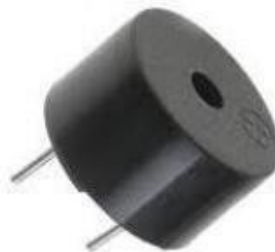
Figure 9. Buzzer

Sound Type: Continuous Beep Resonant Frequency: ~2300 Hz Small and neat sealed package Breadboard and Perfect board friendly