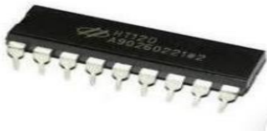
Figure 7. HT-12D Decoder IC

HT12D is a CMOS LSI IC and is capable of operating in a wide voltage range from 2.4V to 12V. Its power consumption is low and has high immunity against noise. The received data is checked 3 times for more accuracy. It has built in oscillator; we need to connect only a small external resistor.